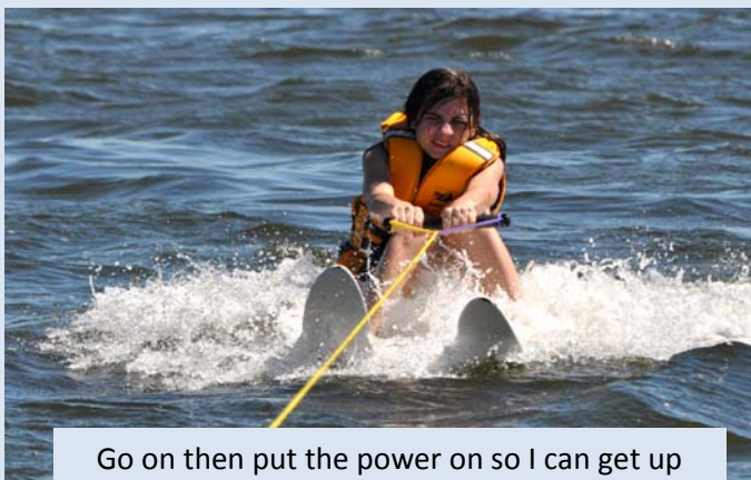
Go on then put the power on so I can get up