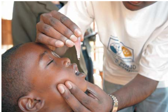
A child gets a Polio Immunization drop