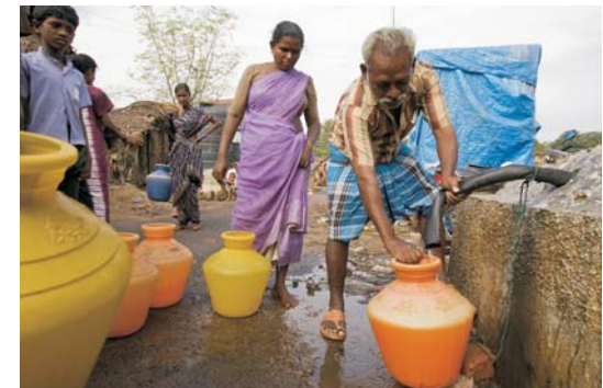
Rotary has many projects around the world, bringing water to remote places

Other schemes we have participated in: The Cord Blood Bank; Foodbank; Drug Awareness bus for WA Schools, and School play equipment.